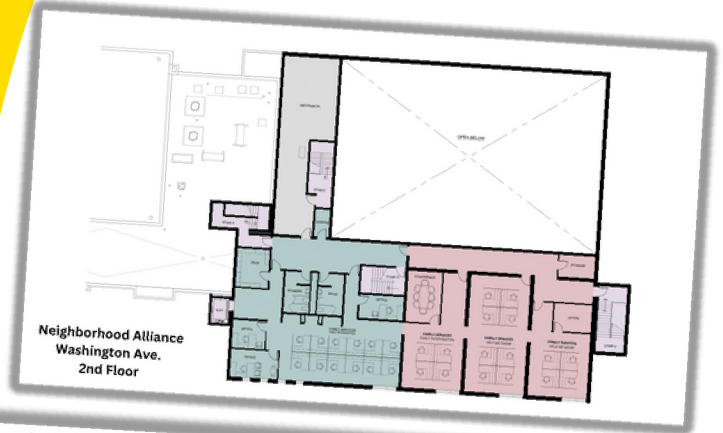
Neighborhood Alliance Washington Ave. 2nd Floor