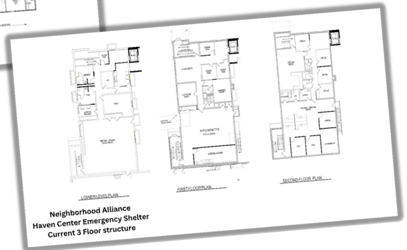
Neighborhood Alliance Haven Center Emergency Shelter Current 3 Floor structure