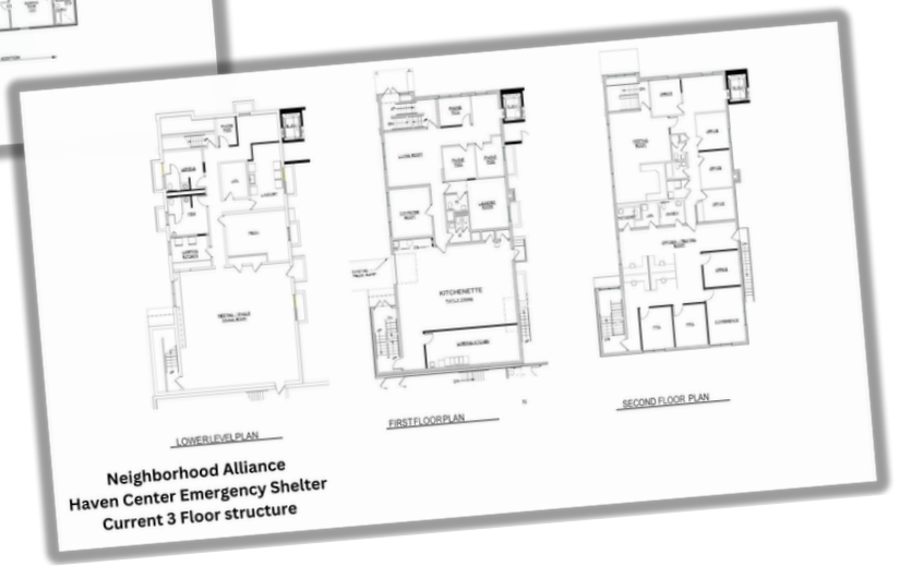
Neighborhood Alliance Haven Center Emergency Shelter Current 3 Floor structure