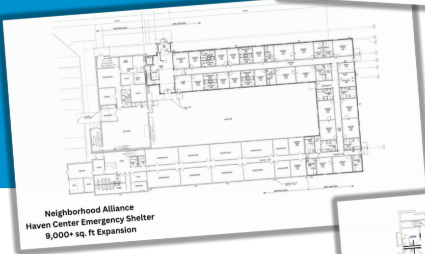
Neighborhood Alliance Haven Center Emergency Shelter 9,000+ sq. ft Expansion