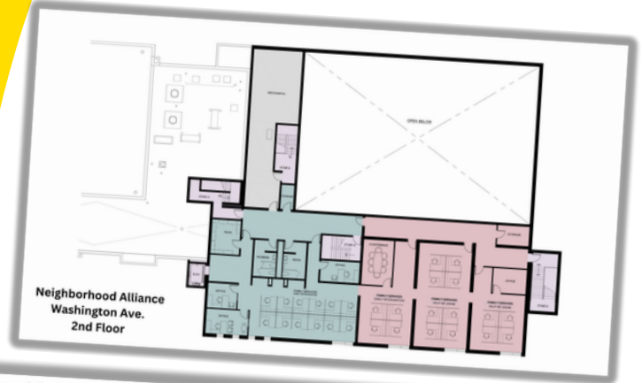
Neighborhood Alliance Washington Ave. 2nd Floor